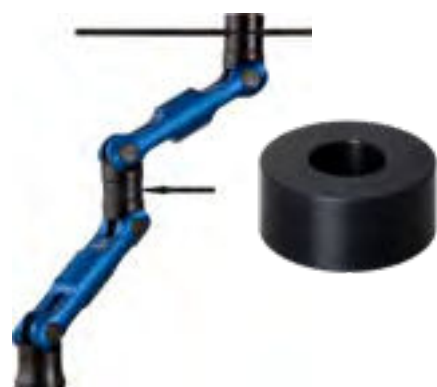
Combination element to extend or to combine two stoppers