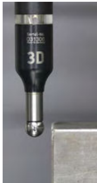
Probing Z axis